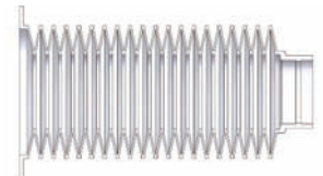
Bellows verified and tested for over 10 Million cycles