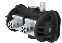
Maple Air Valve with Low-Ice quick exhaust technology